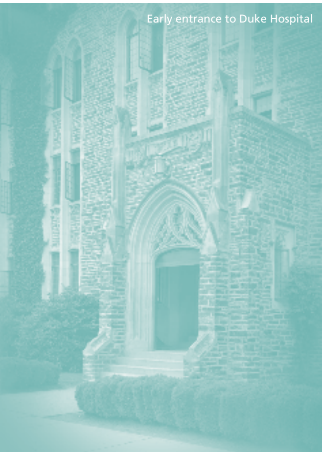
Early entrance to Duke Hospital