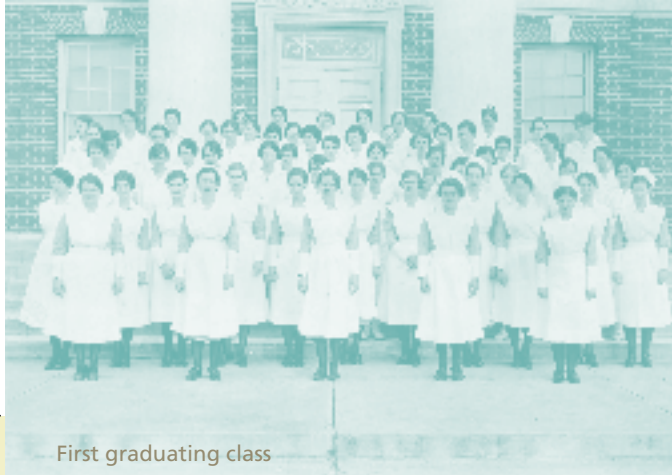
First graduating class

On January 2nd, 24 young women are admitted as Duke School of Nursing's first class in the new three-year diploma program. Tuition is $100 per year.