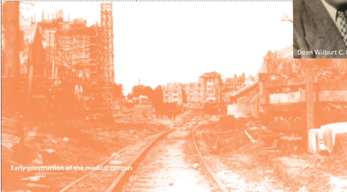
Early construction of the medical campus