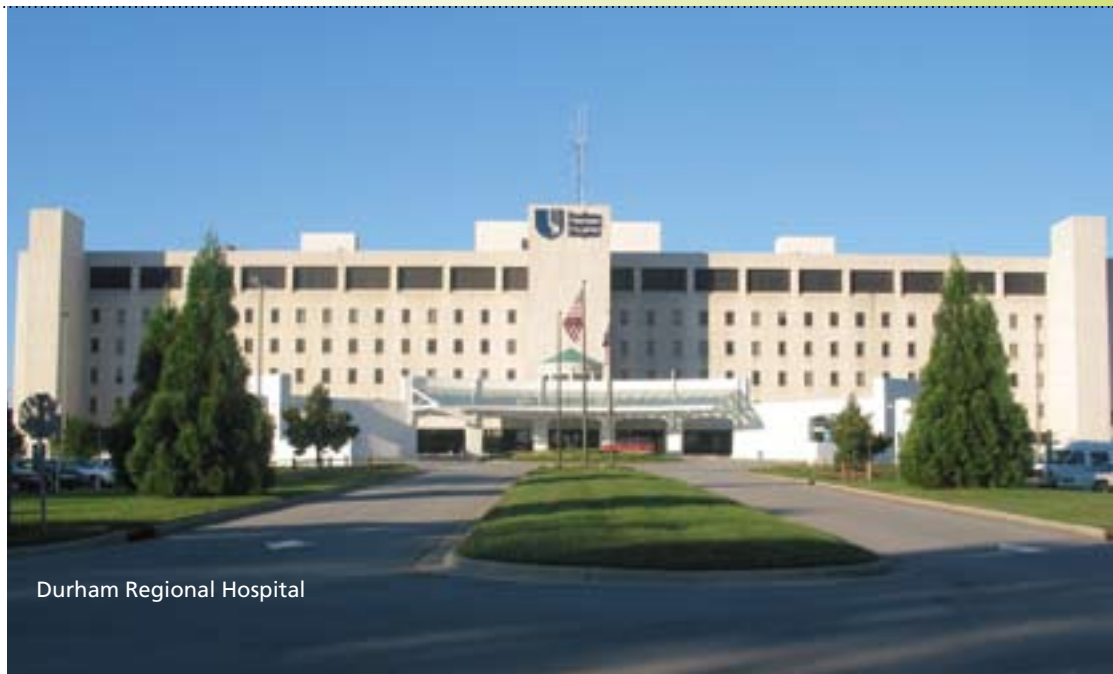
Durham Regional Hospital

Duke Health System expands to include Duke Health Raleigh Hospital, Durham Regional Hospital, Duke Health Community Care and Duke University Affiliated Physicians, adding several hundred more nurses into the Duke Nursing family and expanding learning opportunities for nursing students. Today the Duke University Health System employs more than 5,800 nurses.