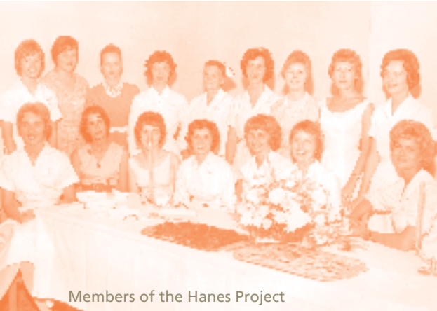
Members of the Hanes Project