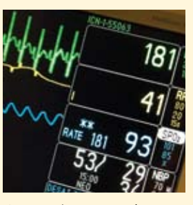
25 Nursing Research Translates Into Better Care for Children