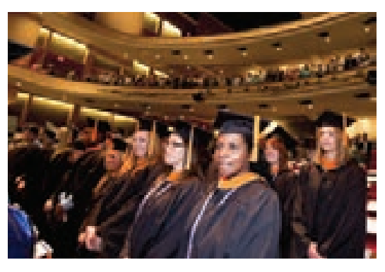
The 2014 graduation ceremony was held at the Durham Performing Arts Center.