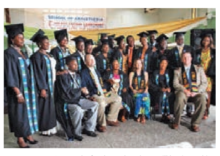
Soon Duke faculty and students will begin working with students and faculty in Ghana.