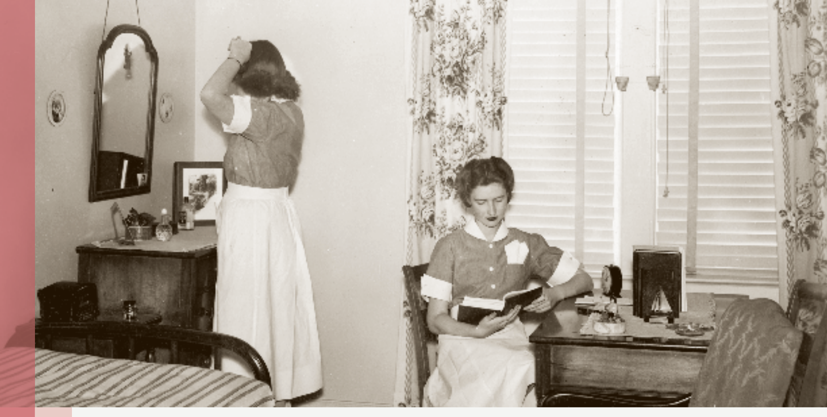
Dorm life included time for both study and socializing.