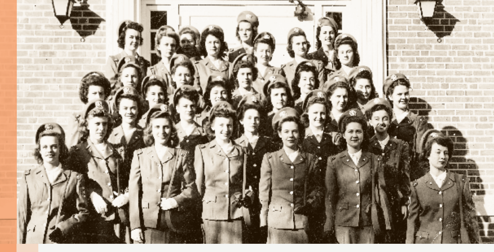
Duke Nurse Cadet Corps nurses in uniform, circa 1947.