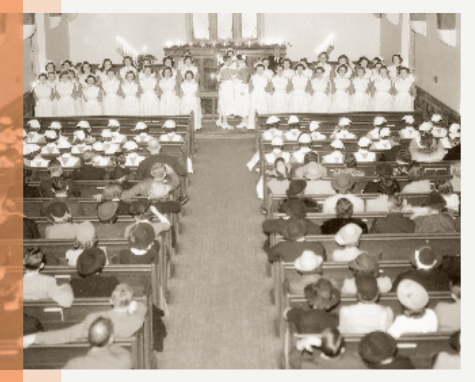
Capping ceremony, circa 1940s-1950s