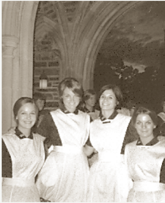
Four members of the class of 1971 pose prior to their capping ceremony.