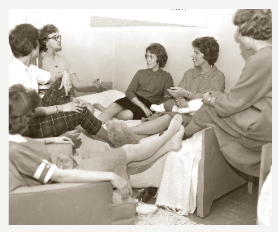
Students often used their dorm rooms for impromptu gatherings.