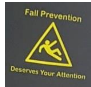
Front of shirt