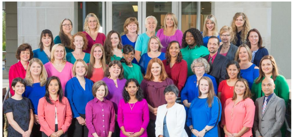
2016 Friends of Nursing Winners

Last Saturday evening, our 36 Friends of Nursing winners and many of our 238 nominees were recognized at the annual Gala. With almost 900 people in attendance, and many more watching via livestreaming, I was so proud to watch each winner accept their award and have the opportunity to congratulate them personally! (If you'd like to view the recording of the event, click here .)