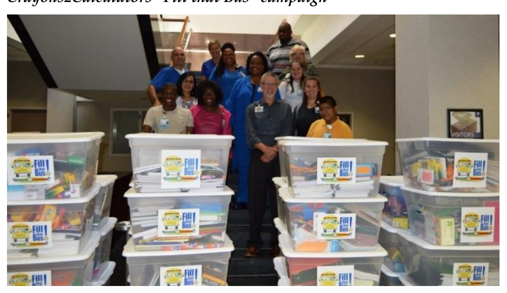
Crayons2Calculators "Fill that Bus" campaign

DRH collected 41 bins of supplies to exceed its goal of 40 for this year's Fill that Bus campaign.